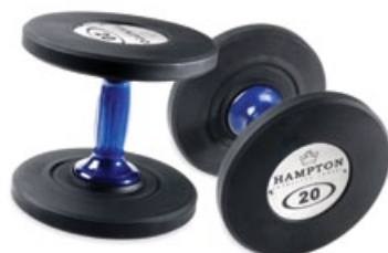
Blue handles are available by special order only