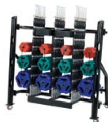
GPS (W: 51" D: 28" H: 56") Holds 40 x 10-lbs., 40 x 5-lbs., 40 x 2.5-lbs. plates, 20 gel-grip bars and 20 pairs of collars