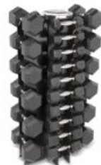
V-4-16 (W: 18" D: 16" H: 42") Holds CBGR, DBU & PH 16 pairs up to 50 lbs.