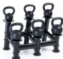
HKB-R-6 (W: 32" D: 19" H: 18") Holds HKB 5-100 lbs.