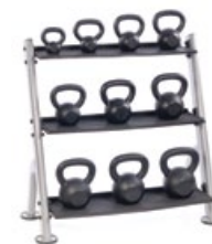
KB-3T (W: 36" D: 18" H: 38") Holds HKB 5-50 lbs.