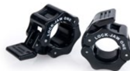
LJC-1 Additional Upgrade