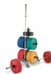
IPT-BP (W: 30" D: 32" H: 55") Holds Bumper Plates and Two Olympic Bars