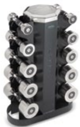
MV-2-5 (W: 18" D: 9" H: 24") Holds CBGR, DBU, & PH 5 pairs up to 25 lbs.