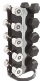
VH-5 (W: 14.5" D: 15" H: 40") Holds CBGR, DBU, & PH 5 pairs up to 75 lbs.