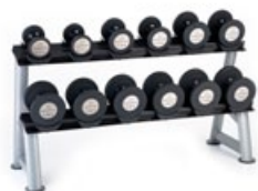
2T-SDL-6 (W: 59" D: 22" H: 32") Holds GGUD, PUD & FDG