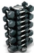
V-4-13 (W: 23" D: 16" H: 42") Holds CBGR, DBU & PH 13 pairs up to 50 lbs.