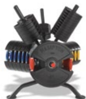
FNR-1 (W: 36" D: 36" H: 40") Holds All Olympic Plates