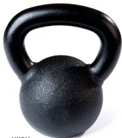
HKBU Urethane Coated

For over 300 years, the Russians have been evolving the Kettlebell to be a brutally effective tool for developing strength, power and mutant work capacity. Kettlebells returned to America in 2001 and their popularity has grown steadily each year. Hampton now offers a premium quality, Russian classic design, urethane coated Kettlebell ranging from 5 to 100 pounds to match the needs of the rapidly growing army of Kettlebell enthusiasts for home or health club use. Grab the handle of true "old school" training and understand what real functional strength is all about.