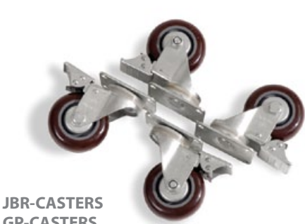
JBR-CASTERS GP-CASTERS NHR-CASTERS