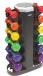
MV-JB-6 (W: 18" D: 9" H: 32") Holds JB-JELLY BELLS 6 pairs up to 15 lbs.