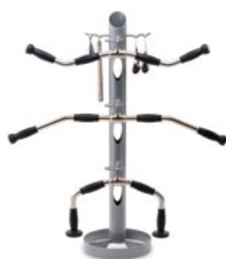
CP-MBR-SET W: 12" D: 12" H: 44"