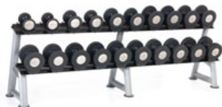
2T-SDL-10 (W: 98" D: 22" H: 32") Holds GGUD, PUD & FDG