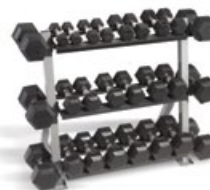
HV-3T (W: 47" D: 20" H: 38") Holds GGUD, PUD, FDG CBGR, DBU & PH