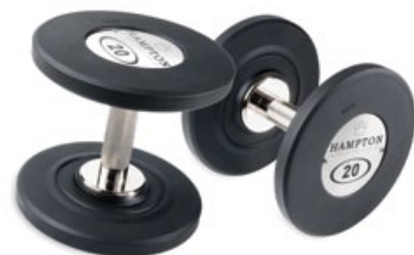
Available with straight steel handles