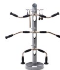
V-MBR-5 (W: 12" D: 12" H: 44") Holds machine attachments 7 pieces (not included)