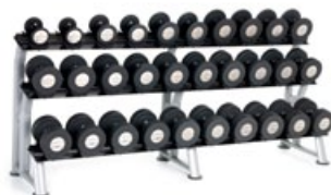
3T-SDL-15 (W: 98" D: 24" H: 42") Holds GGUD, PUD & FDG