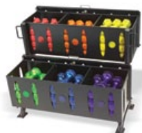
JBR-2T (W: 46" D: 32" H: 43") Holds JB, DBU & NH