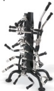
CP-MBU-SET W: 27" D: 17" H: 46"

These cable-machine accessories are all hard chrome-coated with ergonomic urethane grips, and the set includes a vertical racking system to keep them all in order. Unlike their foam counterparts, our urethane grips don't absorb sweat and are much more hygienic and durable.