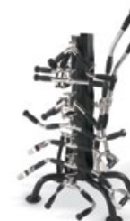
V-MBR (W: 27" D: 17" H: 46") Holds CP-MBU 15 PC Machine Bar Set (not included)