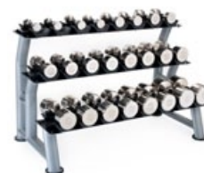
3T-CD-12 (W: 48" D: 26" H: 32") Holds CBGR