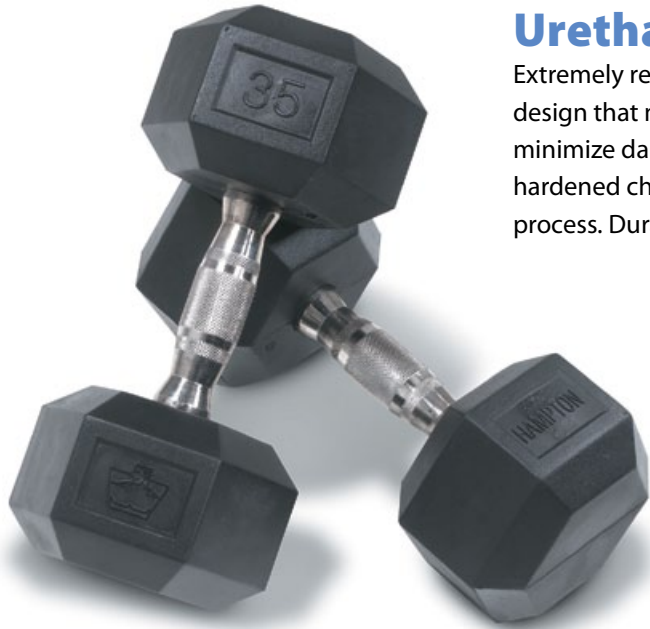
Dura-Bell™ U.S. Patent No. 6,099,443