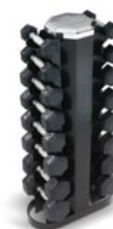
V-2-8 (W: 18" D: 9" H: 42") Holds DBU, CBGR & PH 8 pairs up to 30 lbs.