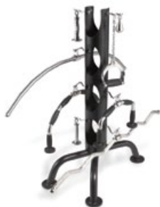
CP-HTP-SET W: 27" D: 17" H: 46"