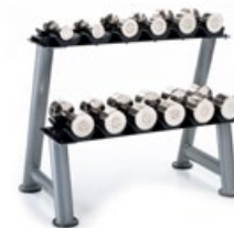
2T-CBGR-6 (W: 37" D: 22" H: 32") Holds CBGR