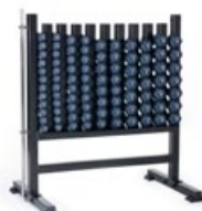
NHR (W: 40" D: 25" H: 42") Holds DBU & NH