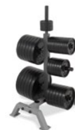
IPT-2B (W: 30" D: 32" H: 55") Holds All Olympic Plates and Two Olympic Bars