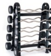
BBR-10 (W: 36" D: 24" H: 53") Holds UB-C/S, PUB-C/S, FBG-C/S, DB-C/S