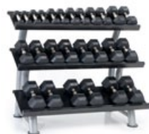
3T-FLT (W: 52" D: 28" H: 42") Holds DBU, PH & HKB