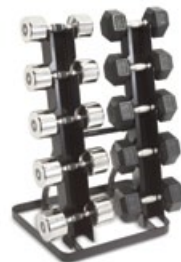
V-TT-5 (W: 31" D: 22" H: 41") Holds CBGR, DBU, & PH 5 pairs up to 75 lbs.